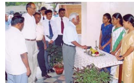
PSG College of Technology Inauguration Ceremony