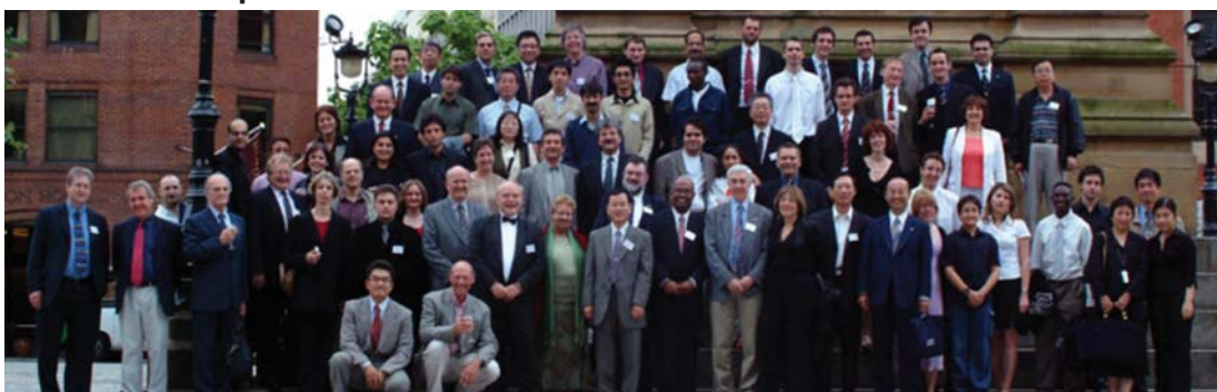
ESDA 2004 Participants